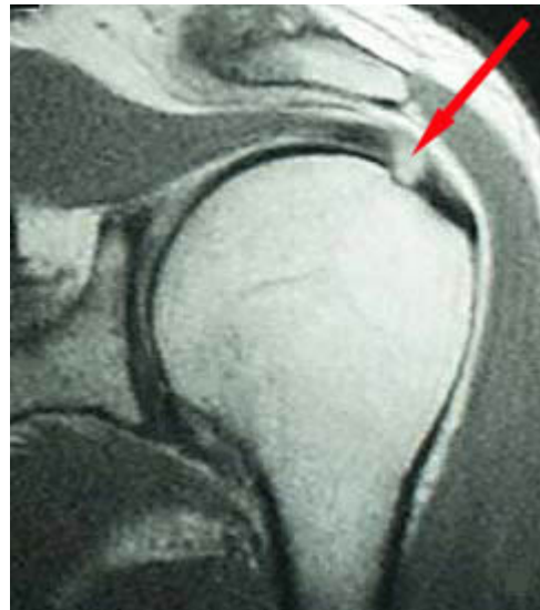
Figure 1: MRI picture showing a torn rotator cuff tendon which has retracted.

For a complete rotator cuff tear surgery is recommended. Surgery for a complete tear is most successful during the first few months after the injury, as when the muscle is completely torn the muscle retracts back. See Figure 1. Over time, the retracted muscle tends to scar in place and becomes less pliable making it more difficult to surgically pull back into place and reattach to the humeral head. Studies have shown that over extended periods of time unrepaired torn rotator cuff muscle turns into fatty tissue. The reason for this is unknown.